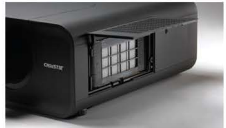
▲ AutoFilter cartridge reduces maintenance cost – up to 10,000 hours before replacement